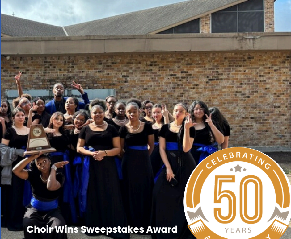
Choir Wins Sweepstakes Award

For students with specific medical needs, forms are provided for your convenience. Click here