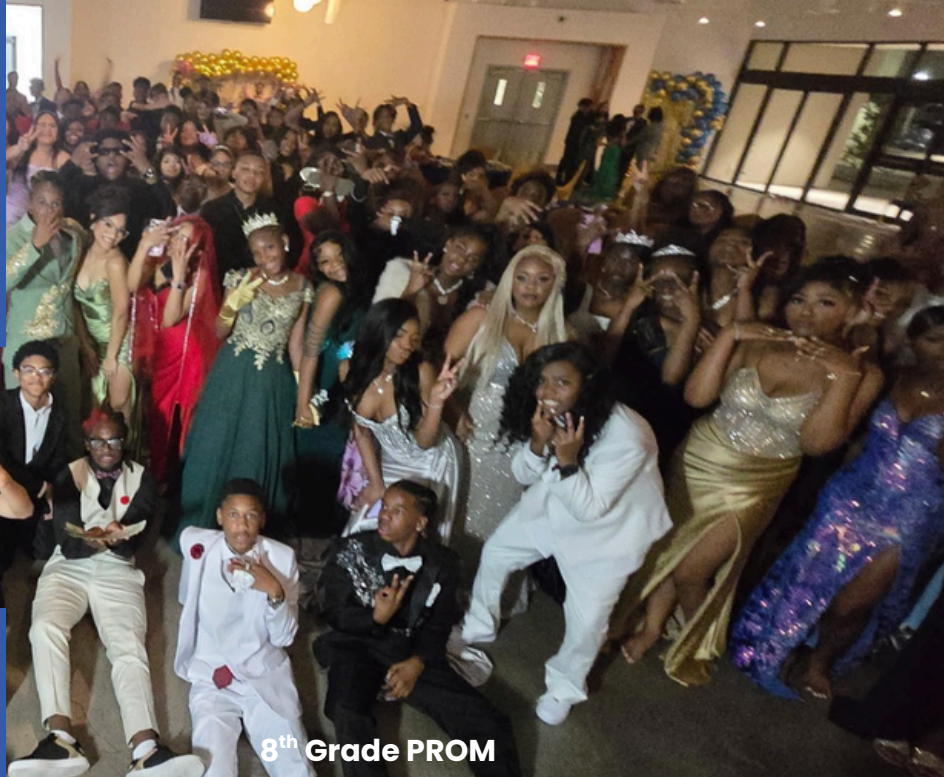
8 th Grade PROM