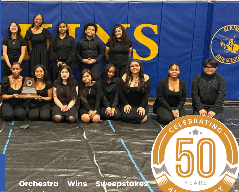
Orchestra Wins Sweepstakes